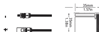
PV Connector Model - TT01, 1000V, 30A, IP67